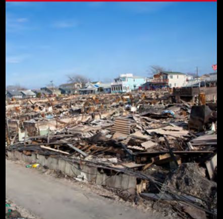
Natural disasters can interrupt primary connectivity in an instant.