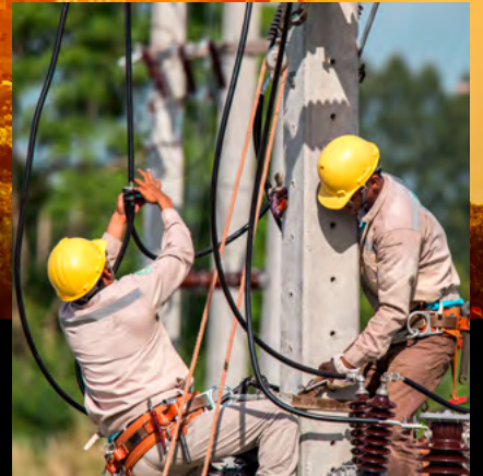
Human error accounts for the majority of annual outage events.